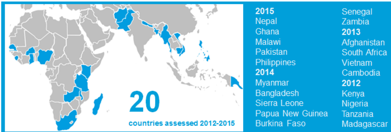
Figure 1: Countries included in the review of 20 MSI health financing assessments

In 2015, MSI's health financing team conducted a retrospective of the twenty HFAs. See Figure 1 for country assessments in the review. The retrospective served to improve the HFA process and outcomes for MSI as an organization, including solidifying our programmatic response to different market contexts; these outcomes have been separately documented 6 7 . Some of the trends identified in the national health financing environments were relevant beyond MSI and these are shared here for the purposes of discussion at a time when our wider sector has noted knowledge gaps 8 . Specific country findings are not presented in this paper.